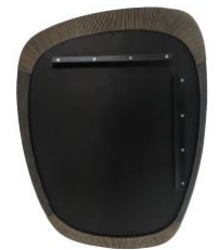
Back view of mirror